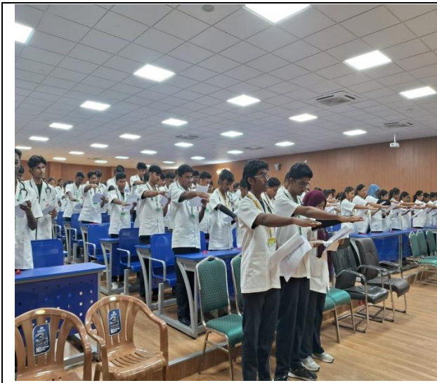
Declaration of the Budding Doctors

(Affiliated to the Tamil Nadu Dr.MGR Medical University & Recognized by the Ministry of Health & Family welfare. Govt. of India New Delhi)