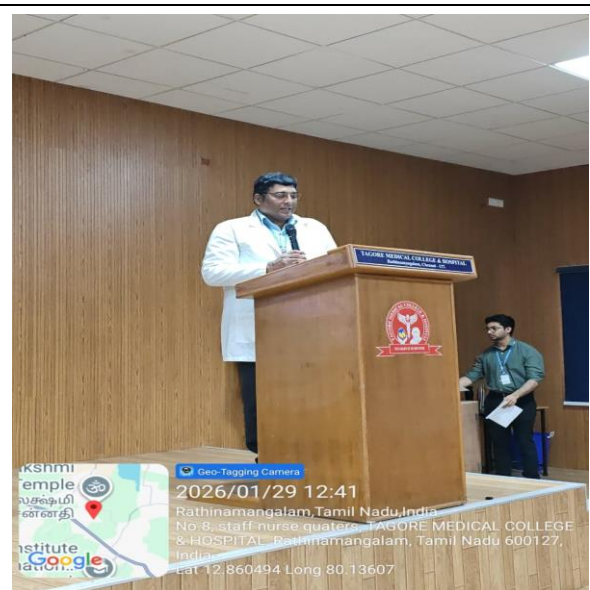
Stethoscope ceremony address HOD Department of Physiology