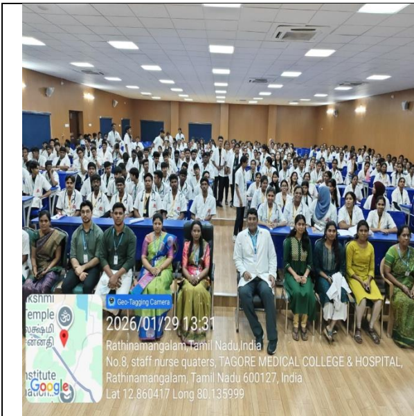
Stethoscope ceremony 2026